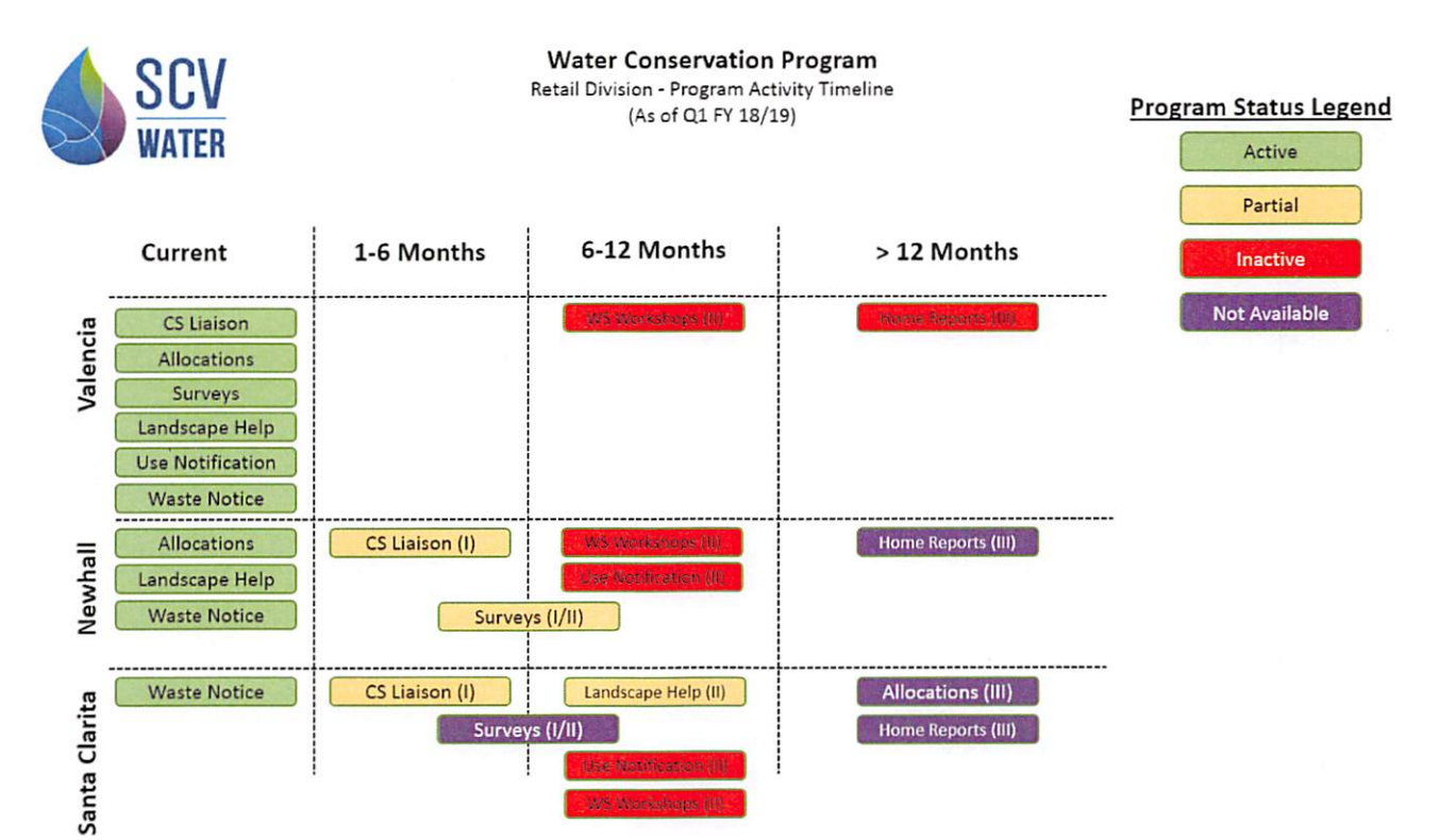
Figure 3 – Water Conservation Program (Estimated Retail Program Schedule)