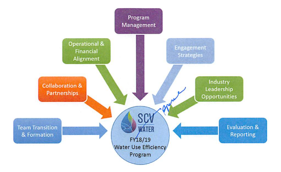
Figure 1 – Draft FY 18/19 Conservation Integration/Operating Plan (7 Strategic Thrusts)

Since the launch of SCV Water, Conservation has been working on transition, integration, and operating components to better serve and assist customers with their water use efficiency goals. To accomplish this, Conservation staff has developed an Integration/Operating Plan (Plan); currently in draft form which is comprised of 7 key strategic thrusts (Figure 1). The thrusts include, but are not limited to: Team Transition and Formation, Collaboration & Partnerships, Operational & Financial Alignment, Program Management, Engagement Strategies, Industry Leadership Opportunities, and Evaluation & Reporting. To date, Conservation has successfully implemented portions of certain thrust efforts including team formation and training, alignment of regional and retail budgets, programmatic activity (specific to existing programs and continuity), and region-wide program alignment planning (discussed below). The plan is updated to include action items salient to each key thrust as they are identified, defined, and developed through capacity-centered environmental scans, alignment with the SCV Water Use Efficiency Strategic Plan, and with stakeholder input.